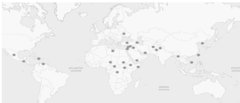
Figure 1: World Map of Global Conflicts as of June 2024 (Global Conflict Tracker, 2024)

Statement of the problem. As of June 2024, the Global Conflict Tracker reports 28 conflicts worldwide, that involve states, nations, and political factions, with six categorized as critical, indicating the highest level of escalation [Global Conflict Tracker, 2024]. Figure 1 shows the locations of these current global conflicts: